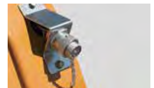
Front Electric/ Multi-Function