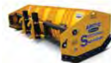
Arctic® Sectional Sno-Pusher™