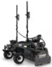
Laser Grading Box

All models come standard with a universal coupler that will work with numerous attachment manufacturers, meaning you can do more with a single machine to give your business even greater versatility. Consult your dealer for details.