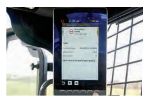
EASE OF TROUBLESHOOTING Short descriptions tied to fault codes simplify communication and troubleshooting with your CASE dealer.

Service is simple. Regular check points are grouped into a single area under the engine compartment cover, easily accessible through the heavy-duty rear door. The entire cab tilts forward in just a few easy steps to access the entire drivetrain compartment for easy service and inspection.