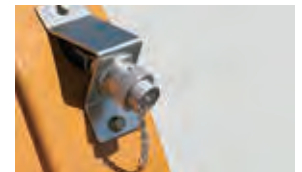
Front Electric/ Multi-Function (excl. SR160)