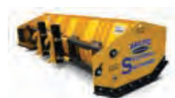
Arctic® Sectional Sno-Pusher™

SEE OUR FULL LINE AT CASECE.COM/ATTACHMENTS