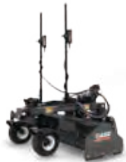
Laser Grading Box