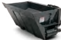
Side Discharge Bucket